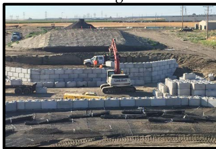
Construction of Gar Swanson Bridge

There has been lots of activity around the Port of Morrow with all its various road projects going on. The Port of Morrow has been working on an access road that breaks off of Internet Parkway leading out to Columbia Avenue. The road consists of a roundabout and a bridge. The last section of road is still under construction and is set to be completed in September.