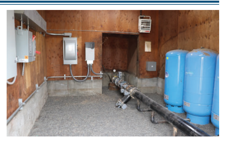
The South Morrow Industrial Park well at Heppner was recently updated with a VFD and PLC.

The Port is implementing a long-term project to upgrade control centers for existing pumps and stations. Programable Logic Controllers are a key piece of technology that adds remote access for monitoring and enabling real-time notification for alerts. Variable Frequency Drives are another element that reduces energy usage for pumps by adjusting the rate of flow based on demand.