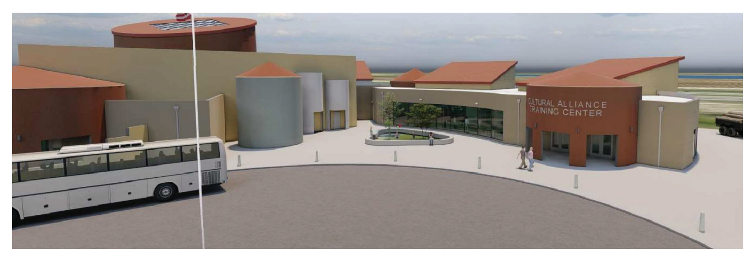
A conceptual rendering of the Cultural Alliance Training Center at SAGE. LKV Architects in Boise, Idaho is working with the Port of Morrow to design the new facility.

The Oregon Legislature ended their 2021 session with the passing of House Bill 5006, which appropriates funds for projects around the state. The Port of Morrow will receive $4.3 million for the construction of the Cultural Alliance Training Center at SAGE.